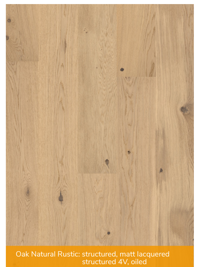
Mistakes and alterations reserved. The colour reproduction shows examples. Please let us show you original wood patterns.